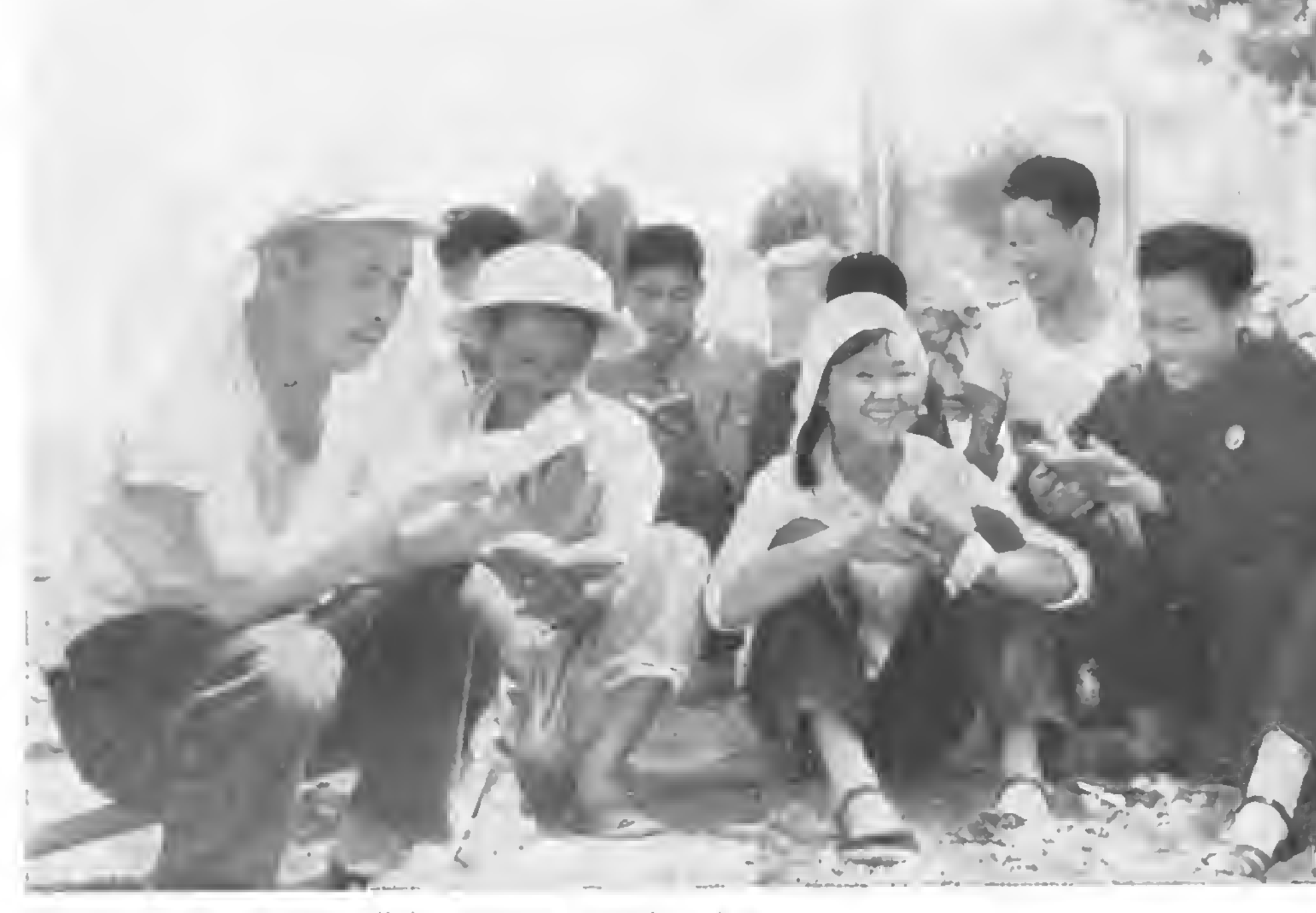
The writer of this article (left) studying quotations from Chairman Mao with commune members during a work break.

With the use of machines and electricity, a technical force has grown up in the countryside. The tractor station has already trained 29 expert tractor drivers. The production brigades have groups of spare-time apprentices who can drive and take care of the tractors well. Other commune members have been trained as technicians in the farm produce processing plants,